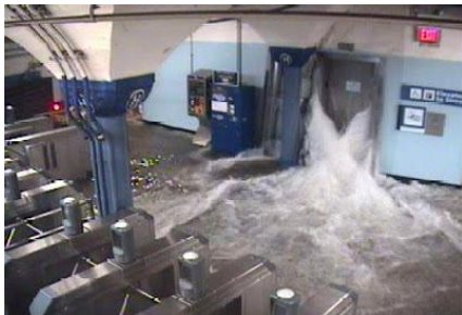
Water shown gushing out of elevator doors.

According to Matthew Jackson of Diversified Elevator Products, LLC, things are not well in the New York City (NYC)/New Jersey area following the landfall of "Superstorm Sandy." NYC is slowly getting back up and running, but initial reports indicate there was severe flooding throughout Lower Manhattan. South of 14th Street, electricity is out, there are flooding issues, and the subways may not be up for another week. The outer boroughs are doing well, except for the coastal areas around Queens, Brooklyn, Staten Island and Long Island. Coastal areas of New Jersey are completely wiped out from flooding, with Atlantic City having been hit hard. Northern New Jersey was hit with the storm's outer bands that included 98-mph sustained winds. – Source ELENET